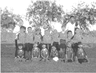
Weed and Seed Teams 1 and 2 with Coaches.

The Boy Scouts of America has launched its Soccer and Scouting program as an outreach to Paradise South youth and families. Soccer and Scouting teaches soccer skills and provide exciting competition, and at the same time boys will be Cub Scouts and learn the life-long values taught in the Scouting program. All of the materials are published in English and Spanish.